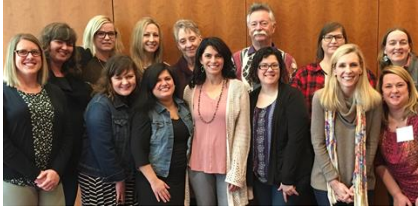
PPA Members attended, presented & exhibited at the National Perinatal Association's Annual Conference , including NICU Healing, The Tiny Miracles Foundation, Parent to Parent Univ of Utah Hospital, NICU Helping Hands & Hand to Hold

PPA Members have coordinated, hosted, presented and participated in a number of national and international conferences recently. We LOVE seeing the active leadership of our members making a HUGE impact!